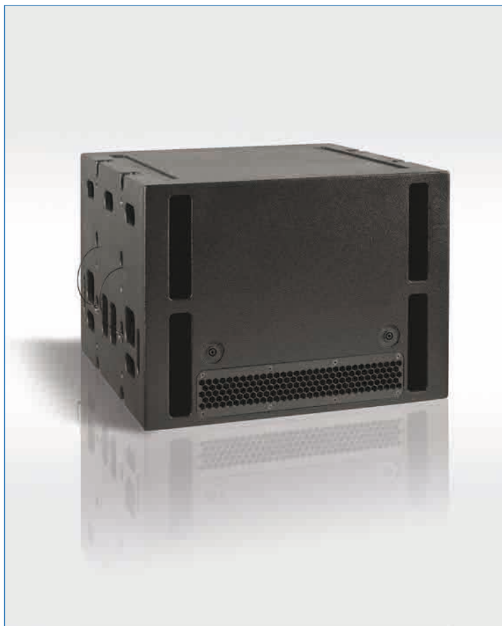
UNILINE UL118B very low frequency speaker

The UL118B is the dedicated infra-bass subwoofer of the APG Uniline line array system. Its sophisticated ergonomics enable easy, safe and intuitive transport and handling. The integrated 4-point rigging system is designed to enable cardioid configurations with multiple speakers inverted within a vertical or horizontal array. The rigging system allows all types of installation: Flying a single cluster of UL118Bs or complex groups combining UL118B and UL210/D. Indeed, the UL118B are perfectly designed to be coupled in a vertical array either with other UL118Bs or in combination with UL210/D line array speakers. Thus all bass system configurations are possible, from horizontal or vertical line arrays, to cardioid or arc configurations, or even cardioid arcs, flown or groundstacked.